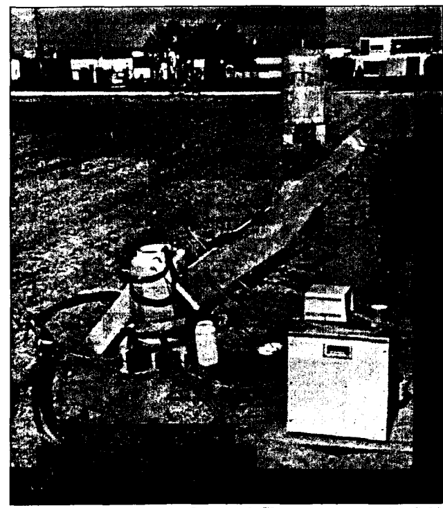
Figure 2. Recirculating furrow infiltrometer used in field experiment with modifications that permit control and monitoring of stream temperatures. Note: The insulation batting over the furrow was needed only on cool days and was not used in this study.

invariant. The main supply tank water was then refilled with enough heated irrigation water to elevate furrow stream water temperatures by 5 to 20 °C. Monitoring continued for 2 to 4 h after altering furrow stream water temperatures. The experiment was repeated over several consecutive days on five individual furrows. The data set provided six furrow responses to temperature-shift events. Infiltration was computed for the furrow-wetted perimeter.