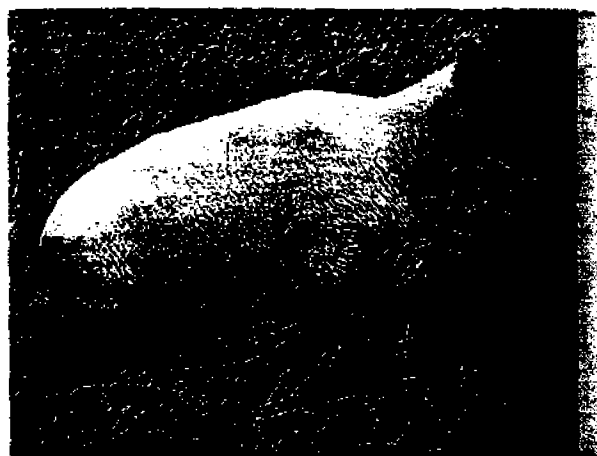
Fig. 9.1. An example of ryegrass staggers; a neurological disorder of livestock grazing endophyte-infected perennial ryegrass pastures. Lolitrem B is the major toxin involved.

Toxins of plant origin can be classified into several major categories, including alkaloids, glycosides, proteins and amino acids, and phenolics (tannins). Alkaloids are bitter substances containing N in a heterocyclic ring structure. There are hundreds of different al-