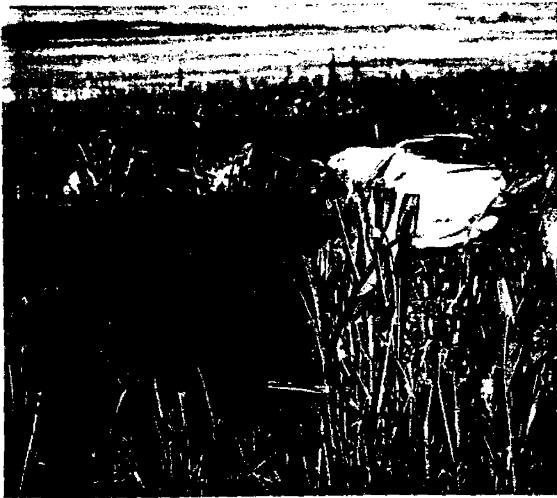
Fig. 9.3. Forage sorghums like sudangrass are excellent feeds for grazing animals. However, they must be managed carefully to avoid cyanide toxicity.

involving excessive mobilization of bone mineral. The demineralized bones become fibrotic and misshapen, causing lameness and "big-head" in horses. Ruminants are less affected, but prolonged grazing by cattle and sheep of some tropical grass species can result in severe hypocalcemia, i.e., Ca deposits in the kidneys and kidney failure. Tropical grasses that have high oxalate levels include Setaria spp., Brachiaria spp., buffelgrass ( Cenchrus ciliaris L.), 'Pangola' digitgrass ( Digitaria eriantha Steud.), and kikuyugrass ( Pennisetum clandestinum Hochst. ex Chiov.). Provision of mineral supplements high in Ca to grazing animals overcomes the adverse effect of oxalates in grasses.