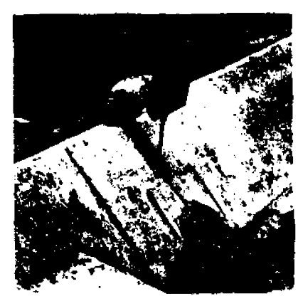
Fig. 6. Drop-closed gate for pipe outlet.