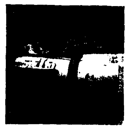
Fig.1. Manually-operated diverter valve.