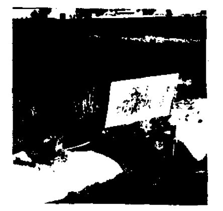
Fig. 5. Drop-closed gate for ditch turnout with control timer.