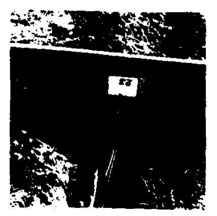
Fig. 2. Flow outlet with slide gate.