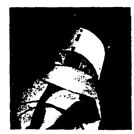
Fig. 3. Method of attaching tubing and membrane to valves and couplings.

Flow outlets in the flexible tubing consist of a pocket cemented to the side of the tube with a circular flow opening and a mating slide to adjust the flow as shown in Fig. 2. The slides can be removed to allow the tubing to be easily rolled up at the end of the season. The tubing is considered permanent and not a temporary throw-away item or system. A fabric fastener material is used to attach the interior membrane of the tube to that of a valve or tubing coupler as shown in Fig. 3. The diverter valves fit the couplings and other fittings commonly used for gated pipe.