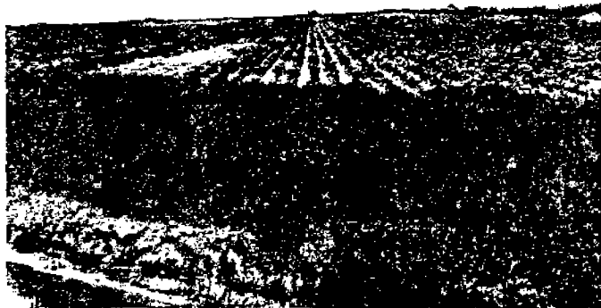
Figure 4. A strip of spring wheat filters eroded soil at the lower end of this sugarbeet field. Wheat is harvested with other wheat on the farm so production area is not lost.