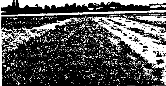
Figure 3. This orchard grass strip effectively filters eroded soil at the lower end of a potato field.