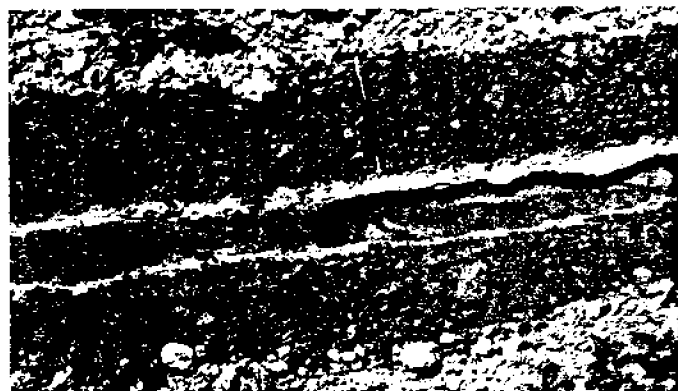
Figure 1. Waterfalls appear where the furrow stream drops into the deeper tailwater ditch. As the soil erodes, these waterfalls move upstream along the furrow.

duction area is not lost when, for example, a double-seeded cereal grain crop is used and harvested when grain fields elsewhere on the farm are harvested (Figure 4) or a strip of alfalfa is left when alfalfa fields are plowed in the normal rotation. This alfalfa filter strip can remain until the field is seeded again to alfalfa or another dense-stand crop.