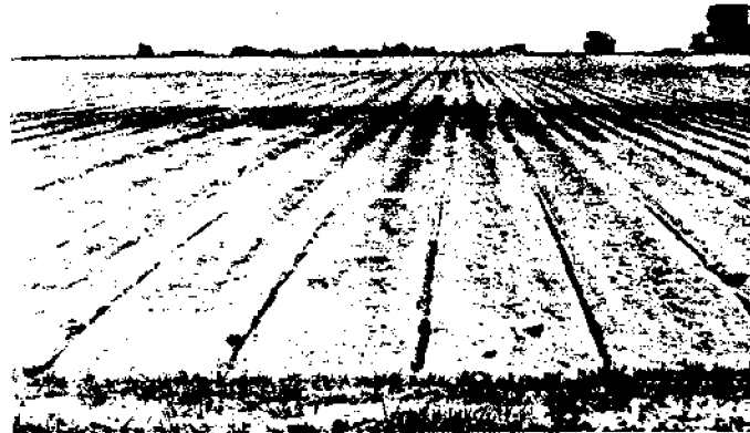
Figure 2. A series of small waterfalls move upstream along each furrow, subtly eroding away the lower end of the field.