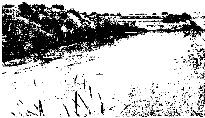
Figure 5. This sediment basin was constructed on a farm drain.