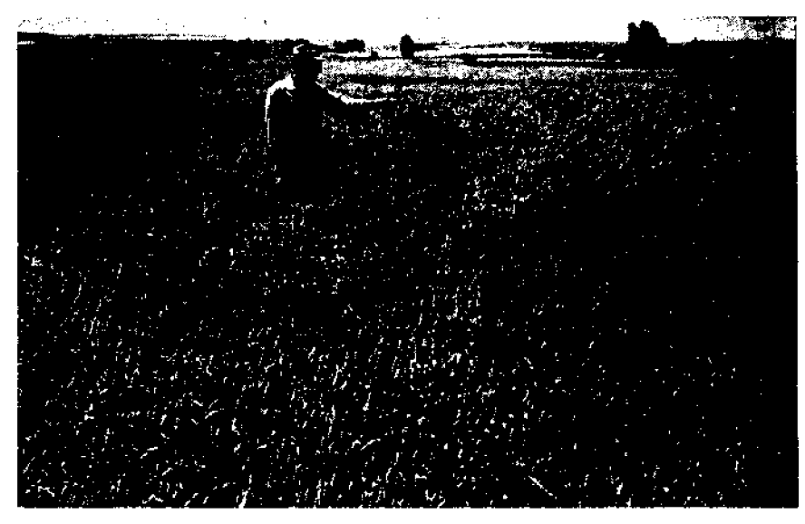
Characteristic poor growth of spring wheat on untreated areas of Sebree slick spot soil on the left can be compared to improved growth on deepplowed Chilcott-Sebree slick spot soil (right) on this Idaho test plot.

Slick spot soils usually have thin silt loam surface horizons and relatively thin silty clay loam to clay loam subsoils underlain with highly calcareous silt loam, loam, or fine sandy loam soil layers beginning at about 16 to 18 inches below the surface. The calcareous soil material is brought up and mixed with the plowed layers by the deep plowing treatment and apparently provides the necessary soluble calcium to reclaim the sodium-affected slick spot soils. The effect of deep plowing 'slick spot' or solonetzic soils of differing chemical properties may not be beneficial. Soil improvement and deep plowing investigations on other naturally occurring solonetzic slick spot soils are being continued.