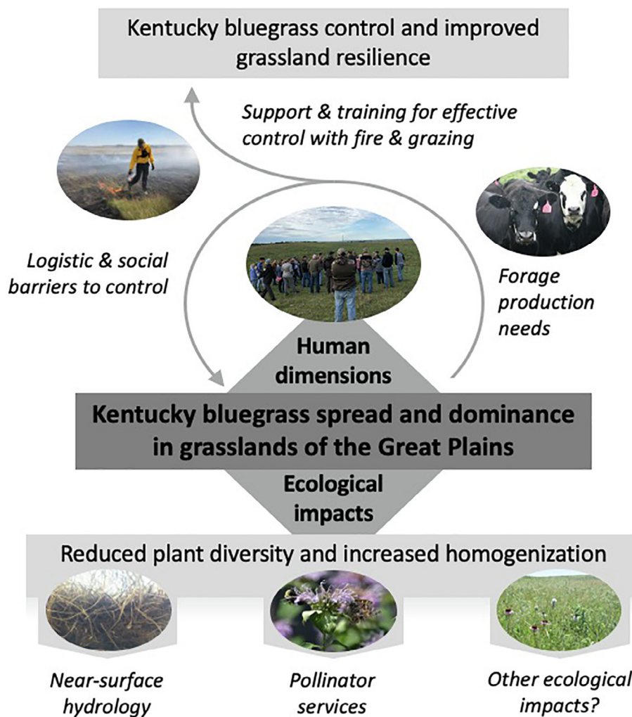
Figure 1. Depiction of recent research on Kentucky bluegrass ( Poa pratensis L.) in the Great Plains, including both ecological impacts of its spread and dominance, as well as human dimensions related to grassland management. Kentucky bluegrass can provide inconsistent forage throughout the growing season. Logistical and social barriers prevent adoption of prescribed fire as a management tool to encourage plant community diversity; however, the lack of management encourages the continued expansion of Kentucky bluegrass. Education and training of livestock producers can overcome the barriers of using prescribed burns and can promote grazing practices that suppress Kentucky bluegrass to retain native plant diversity and provide continuity in forage production. Ecological impacts include reduced native plant diversity, which alters near-surface hydrology and pollinator services. There are likely additional and/or cascading effects associated with this shift in plant communities that are yet to be identified.

comata [Trin. & Rupr.] Barkworth and Nassella viridula [Trin.] Barkworth) in the northern Great Plains require more growing degree days to produce leaf emergence than introduced species. 28,29 This delay in emergence may provide a window of opportunity for applying a targeted grazing strategy.