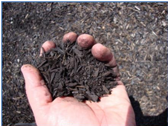
Biochar after being pyrolyzed.

Differences in these studies could be related to soil properties such as texture.