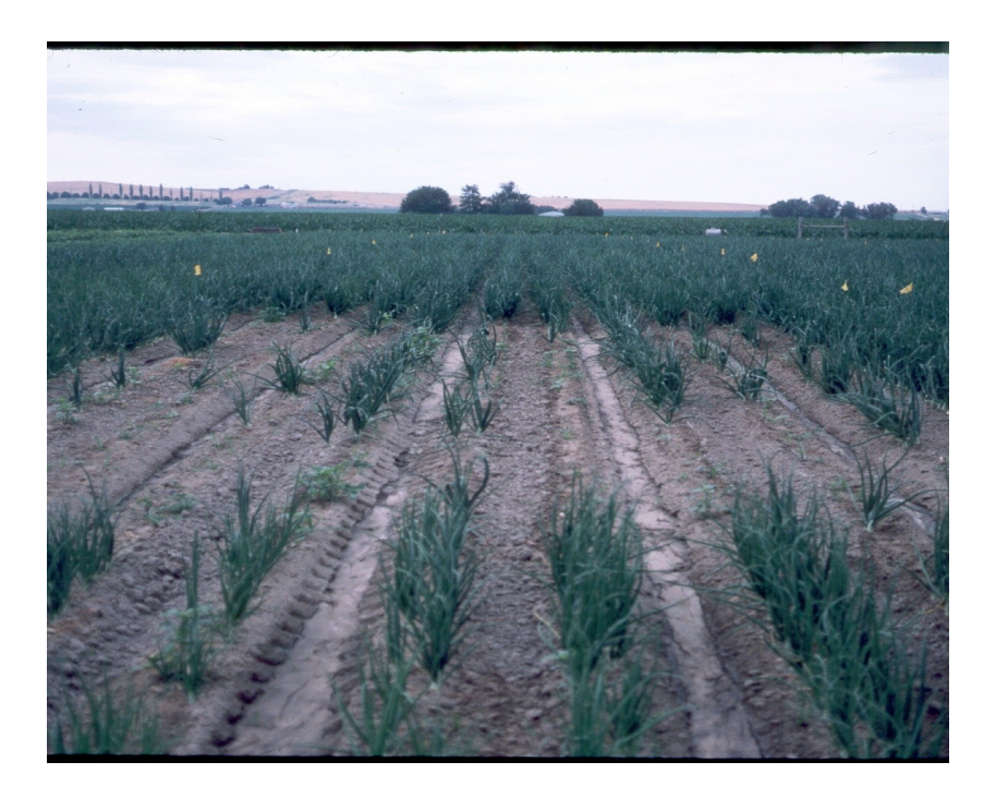
Figure 1. Onion stand from fall applied urea at 200 lb N/acre.