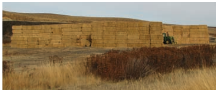
Large amounts of surplus straw are produced with irrigation.

Complex crop rotations on irrigated land that include