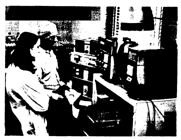
Figure 2.—An atomic absorption spectrophotometer can be used for measuring the level of magnesium in plants, soils, blood, and urine. PN-4042