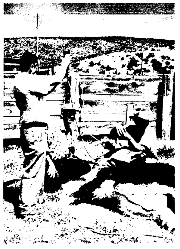
Figure 5.—Injection of calcium-magnesium gluconate into blood-stream of a cow down with grass tetany. PN-4045