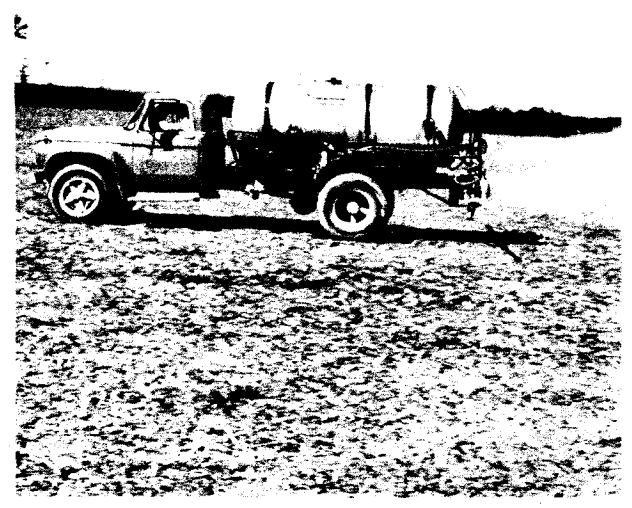
Figure 4.—Spreading a mixture of magnesium oxide and bentonite on grass pastures. PN-4044

(3) Animals can be fed a supplement of special high-magnesium mineral salt blocks or mineral salt mixtures. These are available from feed stores or information on mixing them at home can be obtained from State experiment stations. They often contain dried molasses, grain, or some other material to make them palatable to animals. Also, magnesium may be added to a protein supplement or silage.