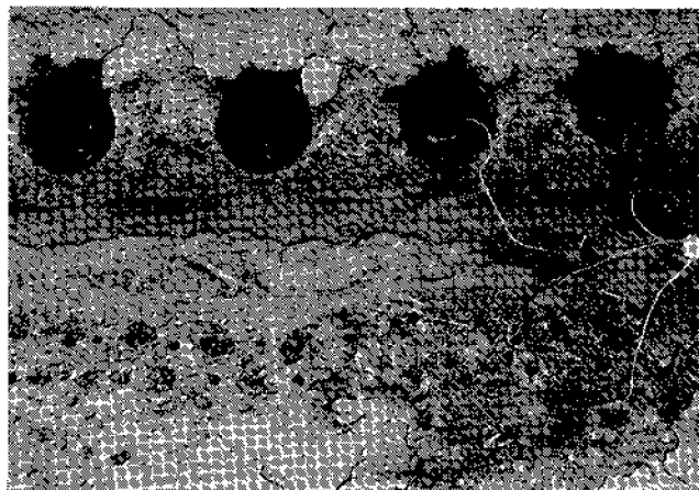
Fig. 1. Conventionally planted seedlings alternated with punch planted seedlings are shown in the foreground. Seedlings in pockets may be seen on the soil ridge. The wires lead to the 127 \mu thermocouples.

Temperatures were measured with 127 \mu copper-constantan thermocouples. For leaf temperature measurements, the thermocouple leads were curved upward, forcing the junction to be held against the underside of the leaf by weak spring tension. Cooling rate, from ambient to 0 C, was 0.1 to 0.3 C per minute. Temperatures were adjusted by regulating the quantity of dry