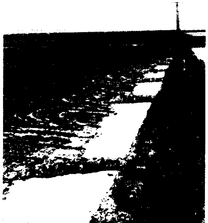
Fig. 1. A buried drain erosion and sediment loss control system operating during the first irrigation after installation.

When the system is first installed, small earthen dams are placed immediately on the downslope side of each vertical inlet to back-up tailwater until it reaches the elevation to enter the inlet. Small ponds or sediment basins are formed that fill with sediment eroded mostly from the lower portion of the field (Fig. 1). These sediment basins usually fill completely with sediment after a few irrigations, and the shape of the lower end of the field is significantly changed (Fig. 2 and compare Figs. 3 and 4)