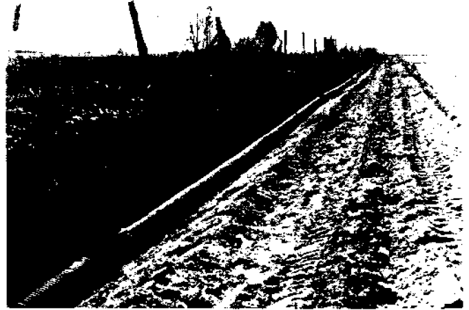
Fig. 6. A buried drain system assembled in a ditch made with a blade and ready to be covered.

end problem, crops can be planted to the extreme lower end of the field, even over the buried pipe. It is usually not necessary to maintain the earthen dams adjacent to the vertical inlets. On some fields the vertical inlet may be extended the second season to trap more sediment and build up the field end more, and in these cases, the earthen checks would be necessary.