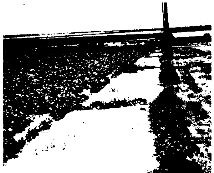
Fig. 4. The same tailwater ditch and sediment basin area shown in Figs. 1 and 3, after four irrigations. The tailwater ditch is filled with sediment, and the convex end problem is corrected.