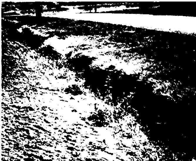
Fig. 3. A tailwater ditch along the lower convex end of a field. This ditch is too deep to cross with farm implements.

The initial cost of installing a buried drain erosion and sediment loss control system requires a significant investment. In many areas, however, cost share programs are available, and farmers can install systems using their own equipment to reduce installation costs. The benefit of these systems in 5 to 10 years will usually recover the initial investment