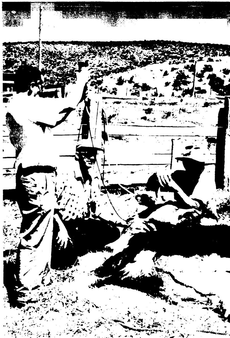
Injection of calcium-magnesium gluconate into the bloodstream of a cow with grass tetany. PN-4045

Some veterinarians use intravenous injections of chloral hydrate or magnesium sulfate to calm excited animals and then follow with a calcium-magnesium gluconate solution. If the animal again goes into convulsions, a second dose of calcium-magnesium gluconate solution may be required. Intravenous injections should be administered slowly by a trained person because there is danger of heart failure if they are given too rapidly.