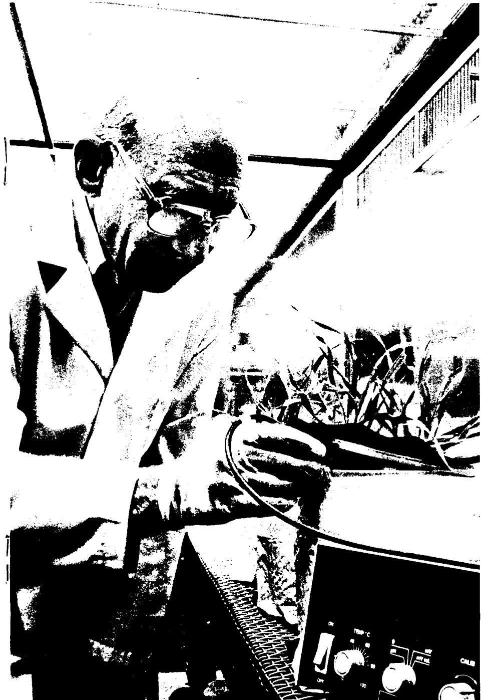
Measuring the pH of nutrient solution used for growing plants in a chamber with controlled levels of light and temperature. BN-50371

(1) Applying magnesium fertilizer and dolomitic limestone to the soil may increase the magnesium concentration in plants, although it may take several years before there is much effect from the dolomitic limestone. Incorporating dolomitic limestone below the soil surface will increase its effectiveness.