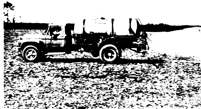
Spreading a mixture of magnesium oxide and bentonite on grass pastures. PN-4044

Licking wheels or licking belts are sometimes used to slowly dispense magnesium oxide or magnesium sulfate in molasses. One must be certain that the magnesium remains in suspension or solution, and that the