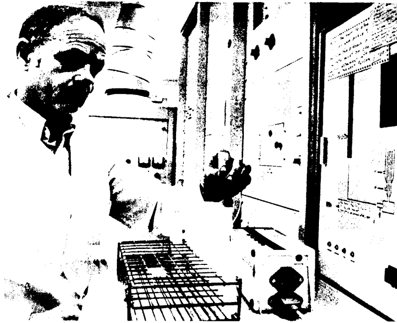
An inductively coupled argon-plasma vacuum spectrometer can be used for measuring the level of magnesium in plants, soils, blood, and urine. BN-50370

An enema of 60 grams (2 ounces) of magnesium chloride ( MgCl_2 \cdot 6H_2O ) in 10 ounces of water has been helpful. The enema may be given with an esophageal or oral calf feeder with the probe inserted 25 cm (10 inches) into the anus. Magnesium is absorbed through the walls of the large intestines and the lower bowel.