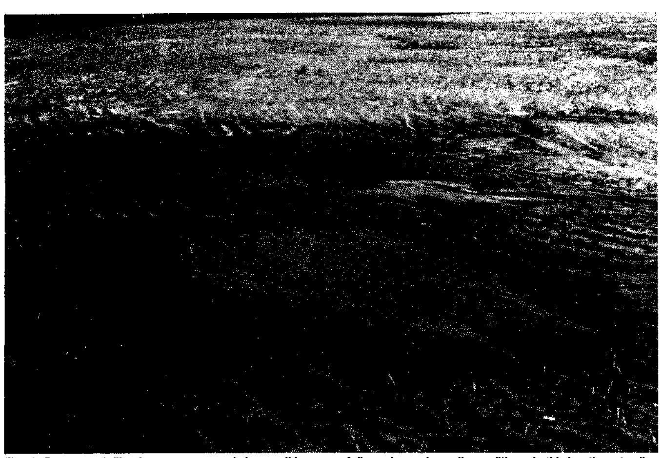
Fig. 1. Poor water infiltration occurs on sandy loam soll because of dispersion under sodic conditions. In this location, standing water remained 7 days after a rain shower.

An old saying is appropriate to remember: "Hard water makes soft soils and soft water makes hard soils." This says that irrigation waters containing predominantly calcium and magnesium salts (low SAR) tend to promote more friable soil conditions. Irrigation waters with low calcium and high sodium ratios (high SAR) tend to cause soils to disperse, form crusts, become compacted and have very low infiltration rates and poor air movement properties.