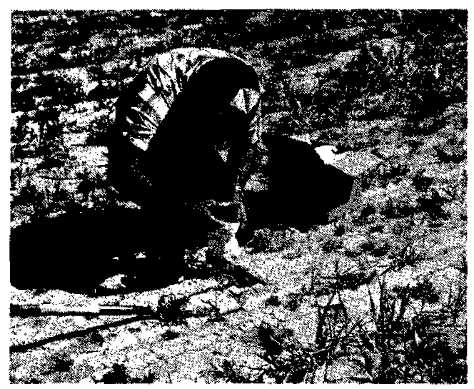
Fig. 3. One quart soil samples are collected for laboratory analysis from areas with poor crop response.

Irrigation water quality in large river systems with large storage reservoirs will usually not change over the season, but water in small storage systems and stream systems with fluctuating flows may change as the flow changes. Water samples should be taken only during the irrigation season and should also be taken as the water flow changes. Once the well or stream