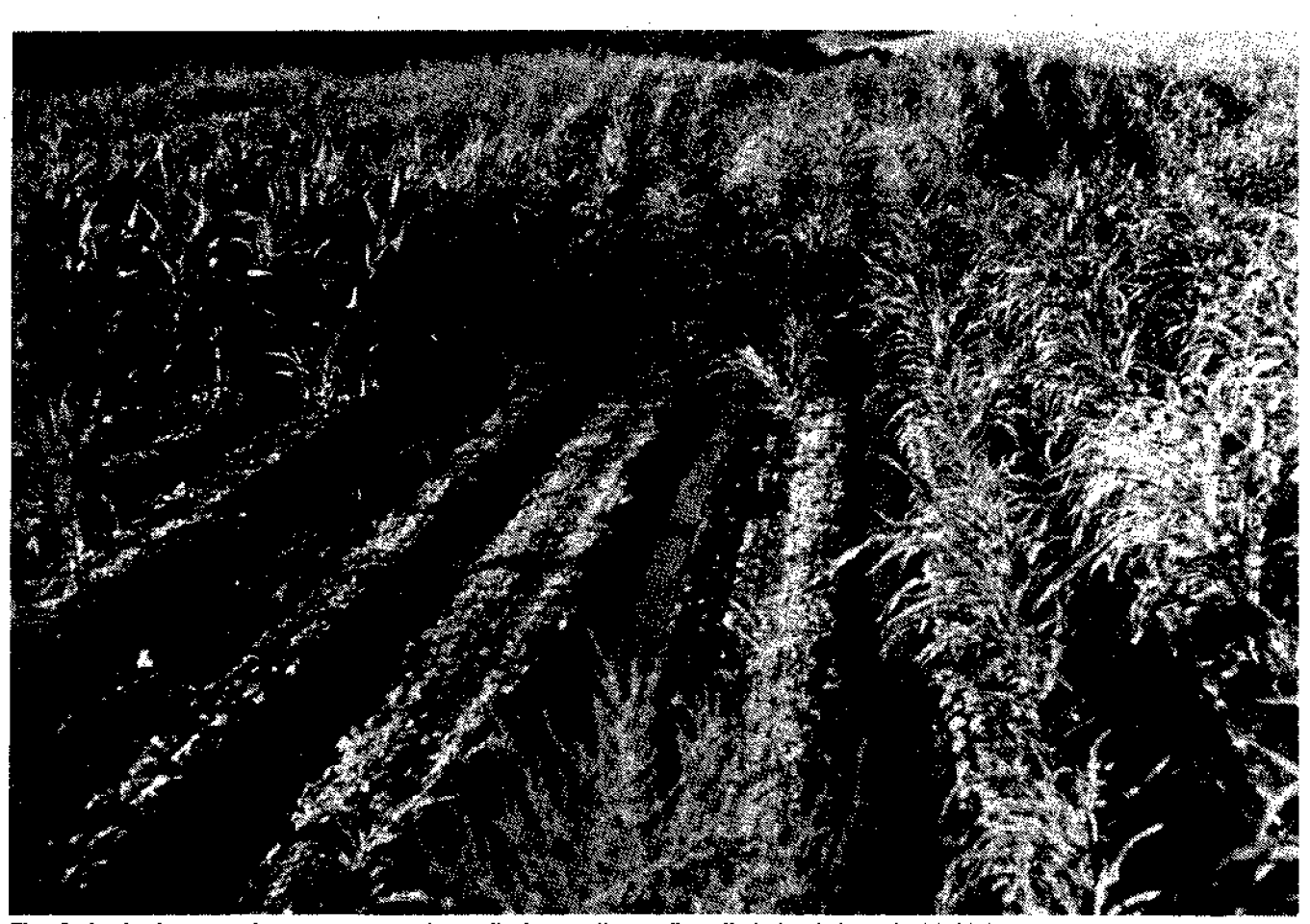
Fig. 2. Lack of crop and poor crop growth results from saline-sodic solls being irrigated with high quality water.