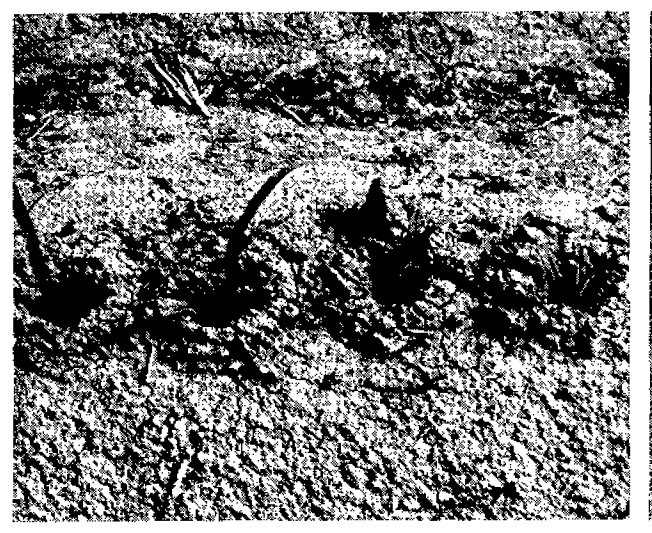
Right below, punch planted bean plants (three on right) have less lateral root development than conventionally planted beans. Lack of lateral roots could be a problem where root rot is severe.

deeper than their normal planting depth, that is, below the zone of salt concentration, would the growth of the seedlings proceed more normally?